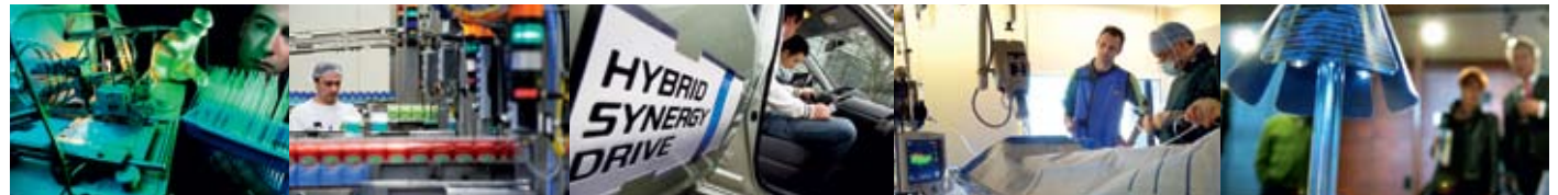
HIGH TECH SYSTEMS & MATERIALS

Brainport Eindhoven Region has been a breeding place for technological ingenuity for more than a hundred years: the light bulb, the first overseas radio transmission and the compact disc are just a few examples. The region is still the cradle of world-famous inventions like the MRI scanner and the LED lamp. A characteristic feature is the high concentration of top technology companies in the fields of High Tech Systems & Materials, Food, Smart Mobility, Design and Lifetec (medical technology). Brainport is home to leading multinationals like ASML, DAF, FEI, OCÉ, Philips and TomTom. Major international companies in the flourishing knowledge and manufacturing industries work closely with knowledge institutions and suppliers from the small and medium-sized enterprise sector.